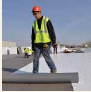
2. Apply membrane, overlapping seams in the direction of water run-off.