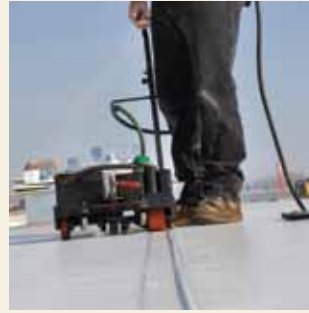
3. Weld seams by hand or with a robotic welder.