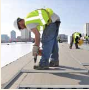
1. Remove all loose dirt and debris and install board stock.